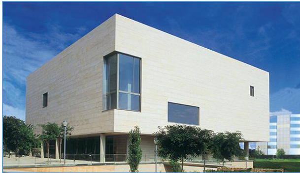
AXA Convention Centre

As a whole, it is more than an auditorium: it is an infrastructure designed to offer quality, flexibility and integral attention through its wide range of services.