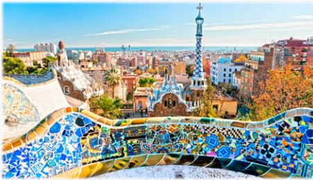
Parc Güell

Catalonia has become one of the favourite tourist destinations of Spain, mainly because of Barcelona, a city that never sleeps and knows how to please the big majority. With a history among the oldest in Europe, Barcelona offers a mixture of inland and seaside charms that panders the interests of everybody. The variety of artistic treasures, Romanesque churches and the works of famous artists such as Dalí, Gaudí, Miró or Picasso will make of your visit to the city a remarkable experience.