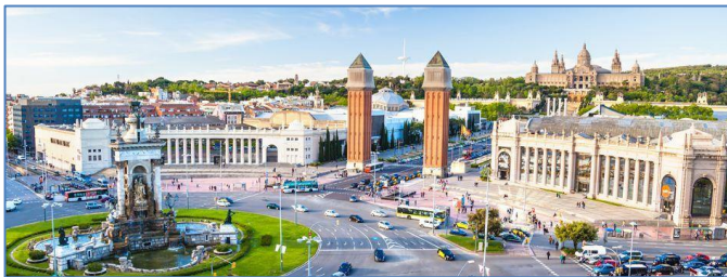
Plaza Espanya (Source: www.viajero-turismo.com )

Europe which has transformed it into the very modern, yet incredibly old city. This beautiful city is full of what European cities are known for (outdoor markets, restaurants, shops, museums and churches) and which makes it the perfect scenario to get lost in its picturesque streets and avenues. Moreover, Barcelona's extensive and reliable Metro system will take you to more far-flung destinations. The core centre of the town, focused around the Ciutat Vella ("Old City"), provides days of enjoyment for those looking to experience the life of Barcelona while the beaches the city was built upon provide sun and relaxation during the long periods of agreeably warm weather. [Source: www.wikitavel.org ]