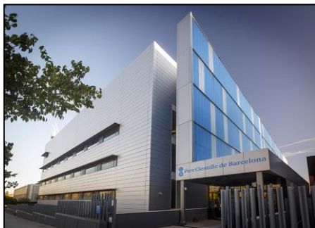
Parc Científic de Barcelona

The aim of the Park is to bring together public and private research environments, facilitating the transfer of knowledge, research and innovation in the public and private sectors via smart space, technology and relations management as well as PCB discourse. [Source: www.pcb.uib.edu ]