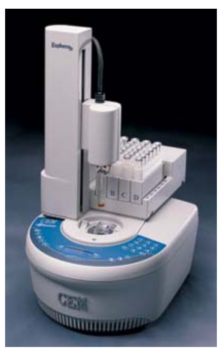
Figure 1. Microwave reactor CEM Explorer

The series of reactions were carried out for methacrylate carbazole monomers with different molecular structures (vinylcarbazole and 2-(9-carbazolyl)ethyl methacrylate).