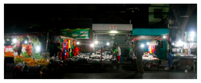
The Extended Night Street Market In Tambora