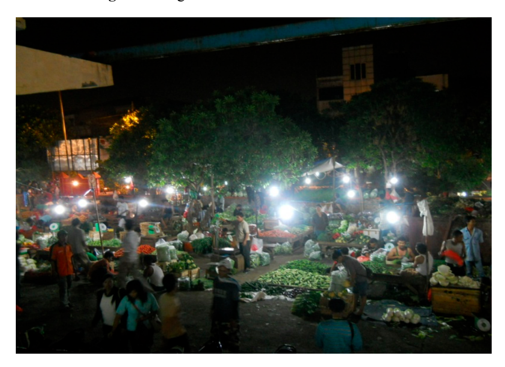
Figure 3. Vegetable Wholesales Market Tambora.

Originally was set up as alternative wholesales vegetables market for the north Jakarta because the official wholesales located far away in the east part of the city. The night market started at 5 pm and is partly using parking space of the official neighbourhood market and partly the frontage of the shops after they are closed. Within more than 10 years the Tambora vegetable market became socially and economically establish but not legally.