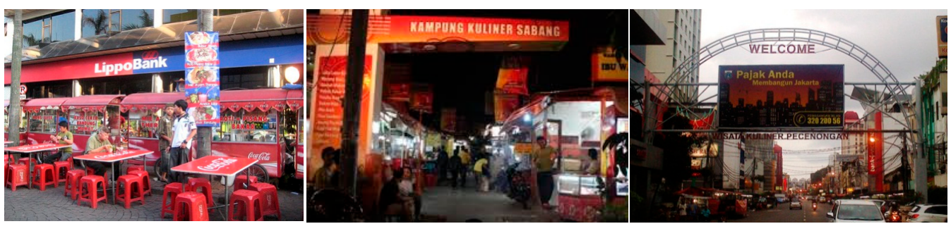
Figure 8. Food Bazaar in Jakarta.

The traditional food bazaar has specific clients, most of them targeted lower income working in offices. A small number of them is opening in the evening hours and become a popular eating place for young peoples and lower incomes families. Some of them are popular for its special characters like chienese food in pecenongan, Grilled Seafood in Gunung sahari, Grill chicken spear in Jl.Sabang or West-Sumatra Food in Kramat.