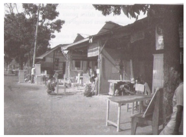
Production and Market place of Furniture with Recycling Wood panels