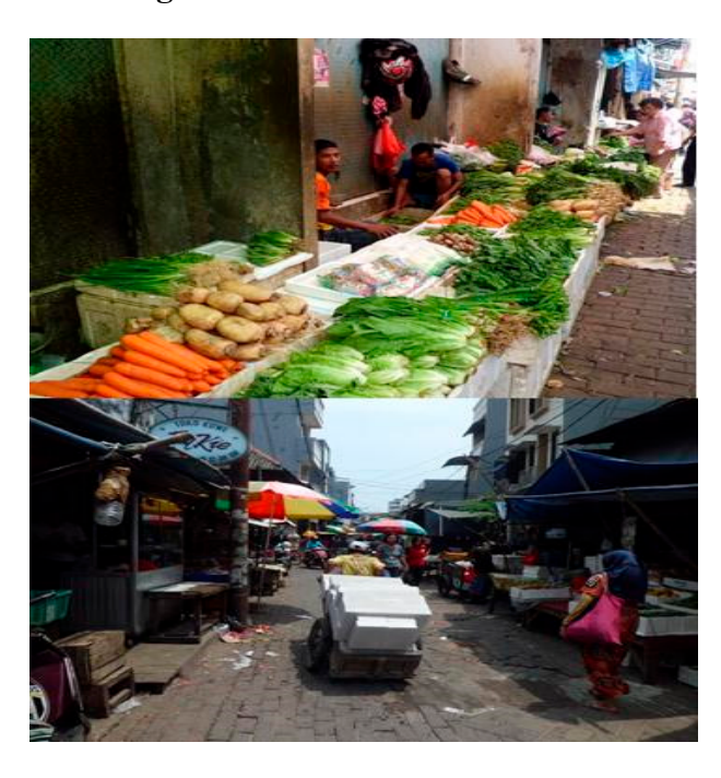
Figure 2. Petak Sembilan Market.

In each neighbourhood the city government (cq Market agency) provided the inhabitant with a neighbourhood market. Its number is about 300 in the whole city. Since the expansion of the supermarket and hypermarket included Lotte and Carrefour, these neighbourhood markets have lost its competitiveness. Some of them are degraded and the government often using as argument to privatized the market. The privatization has the impacts in the marginalization small and micro traders and the exclusion of product of small home industry because the private management prefer to be supplied by the big agrarian and food industries.