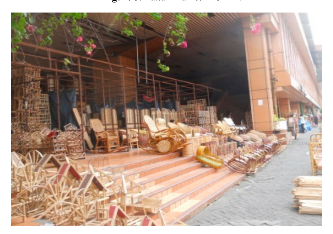
Figure 5. Rattan Market in Cikini.

Similar to the flower culture is almost the whole handicrafts, which are producing household articles from bamboos, wood or rattan is in fact originated from local pre-colonial tradition. A further development base on the tradition is in the 1980ties with the production of furniture from the traditional materials. Today furniture from bamboos and rattan are worldwide well known and it has its fanatic lovers.