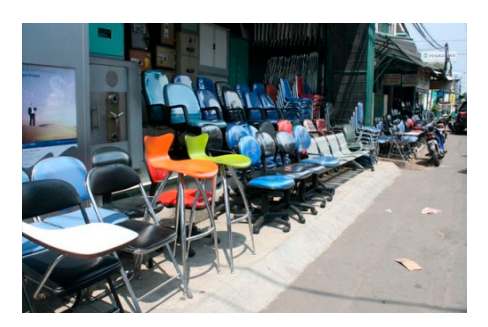
The Recycling Office Equipment