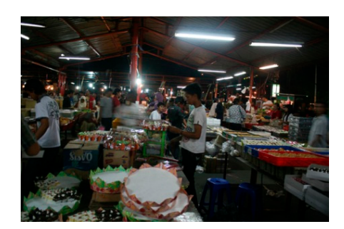
Figure 11. Market with Permanent and Half Illegal Status.

the trader a 100% guarantee that they can stay forever in that particular market. This is happen usually as the city government decided to modernize the traditional market. In a number of redevelopment we can find many cases that the original traders with strong legal status are being marginalized through "market mechanism" because other vendors are ready to pay more.