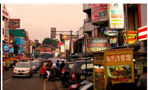
The Food Bazaar in Pecenongan