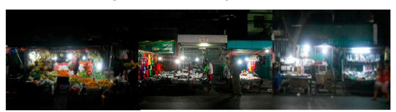
Figure 6. Extended Tambora Night Street Market.

The number of these kind of street market is from all the traditional markets is without any doubt the highest one, they are spread all over the city, where ever it is possible to get locations, in every corner of the road, in frontage of shop housing, in open space, mostly illegal or at least half-legal. Their locations are usually oriented to the surrounding areas of high density urban kampongs because a big percentage of their clients are the inhabitants of such kampongs.