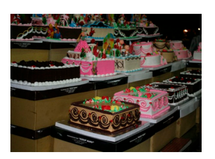
Figure 13. The Snack and Cookies Market as the Best Adapted Market for the Integrated Cultural Process.