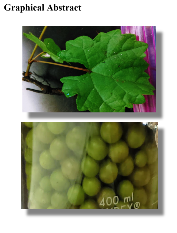
Fig. 1 . Fresh Vitis leaves, roots and grapes from the Organic Garden at St. Thomas University.

Gardens, FL 33054, USA; E-Mail: <u>mpina@stu.edu</u>