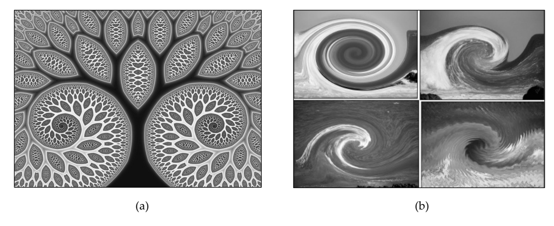
Figure 1. Examples of a fractal pattern (a) and an altered wave pattern (b).

Do humans impose patterns on the natural world or is nature replete with patterns? Because our brains essentially construct facsimiles of the world via our senses, memory and other inputs, this question has long been contemplated. Apparently, myriad dissimilar processes (e.g., biological chemical, geological, hydrological) generate the remarkably similar patterns that we perceive in nature. It has been hypothesized that there is no scientific law of pattern formation, but rather a common recipe for pattern creation that takes into account non-equilibrium conditions, nonlocal events and thresholds for change [3]. Explaining spatial or temporal patterns through the analysis of their components and processes (reductively) is difficult because patterns frequently emerge as a property of entire systems. As such, systems theory represents a viable approach to water quality, although its requisite networks are among the most abstract renditions of patterns.