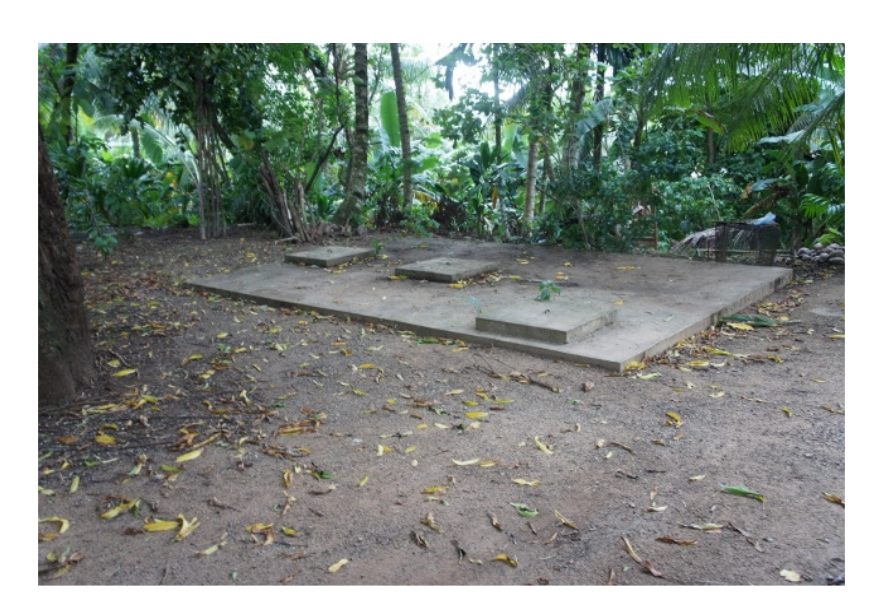
Figure 2. Large communal septic tank used for a remotely located village on Yap.

As noted in the Tables 1 through 4, many of the communal septic tanks appeared to be fully functional and a resident manager with knowledge of the system was often present who could attest to periodic servicing. There were some concerns, though, such as the septic tank at Rumuu Early Childhood Education Center (Table 2), which is positioned in the tidal zone and encroached by seawater. In addition, there were a couple of tanks covered with vegetation (Tables 2 and 3) and one case were the location of the tank could not be visually confirmed (Gilman Elementary School, Table 3), In these cases it is doubtful whether the tanks were being properly maintained. Furthermore, at Maap/Tamilaeng Elementary School (Table 3) the septic tank was located down a steep slope in a forest growth and was out of reach of the pump truck. This septic tank was overloaded and extremely foul and no doubt will have to be abandoned in favor of a more suitable location in due time.