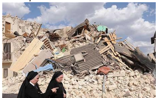
Figure 1. Nuns walk past the ruins

L'Aquila was largely destroyed by earthquakes in 1315, 1319, 1452, 1461, 1501, 1646, 1703 (until that time altogether about 3000 victims) and 1786 (about 6000 victims of this event only). The city was rebuilt and remained stable until October 2008, when tremors began again. From January 1 through April 5, 2009, additional 304 tremors were reported. Giampaolo Giuliani (L'Aquila citizen) for many years working for the Italian National Institute of Astrophysics predicted a major earthquake on Italian television a month before, after measuring increased levels of radon emitted from the ground. He was accused of being alarmist by the Director of the Civil Defense, Guido Bertolaso, and forced to remove his findings from the Internet. He was also reported to police a week before the main quake for "causing fear" among the local population when he predicted an earthquake was imminent in Sulmona about 50 km from L'Aquila, on 30 March, after