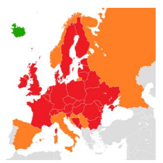
Figure 3. Airspace completely (red) or partially (orange) closed to air traffic

Delays and cancellations hit airports from Toronto to Tokyo, and the problems had cost the global air-travel industry an estimated $200 million a day.