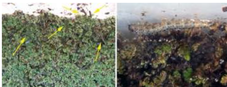
Figure 4. Nomophila noctuella larvae pathway in margins.