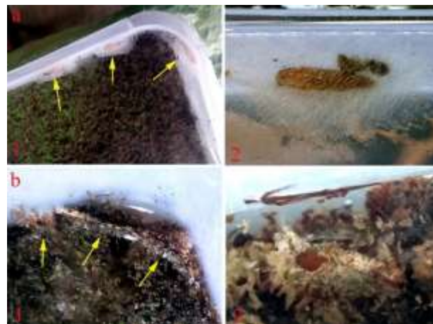
Figure 3. Pupation site (1) and pupa (2) (a): Nomophila noctuella , (b): Diasemiopsis ramburialis ).

Behavioral observations of both species indicated that D. ramburialis larvae move in corridors that made by silken webs among the Azolla spp. leaves. Therefore the larvae pathway on Azolla spp. in this species were distinctive (Figure 2b1,b2). They rarely left these corridors and pupation always occurred in these shelters (Figure 3b1,b2). In N. noctuella the larval pathway was under the Azolla spp. leaves and larvae just bind over leaves to make a union layer in order to move under the leaves. As the result, they produced fewer amounts of the webs and the larvae pathway were not as clear as D. ramburialis (Figure 2). In addition, N. noctuella larvae wandered on Azolla spp. regularly and leave frass near the pathways (figure 2a1) and due to wandering behavior of larvae in N. noctuella pupation occurred in places that were somewhat far from feeding sites (Figure 3a1,a2).