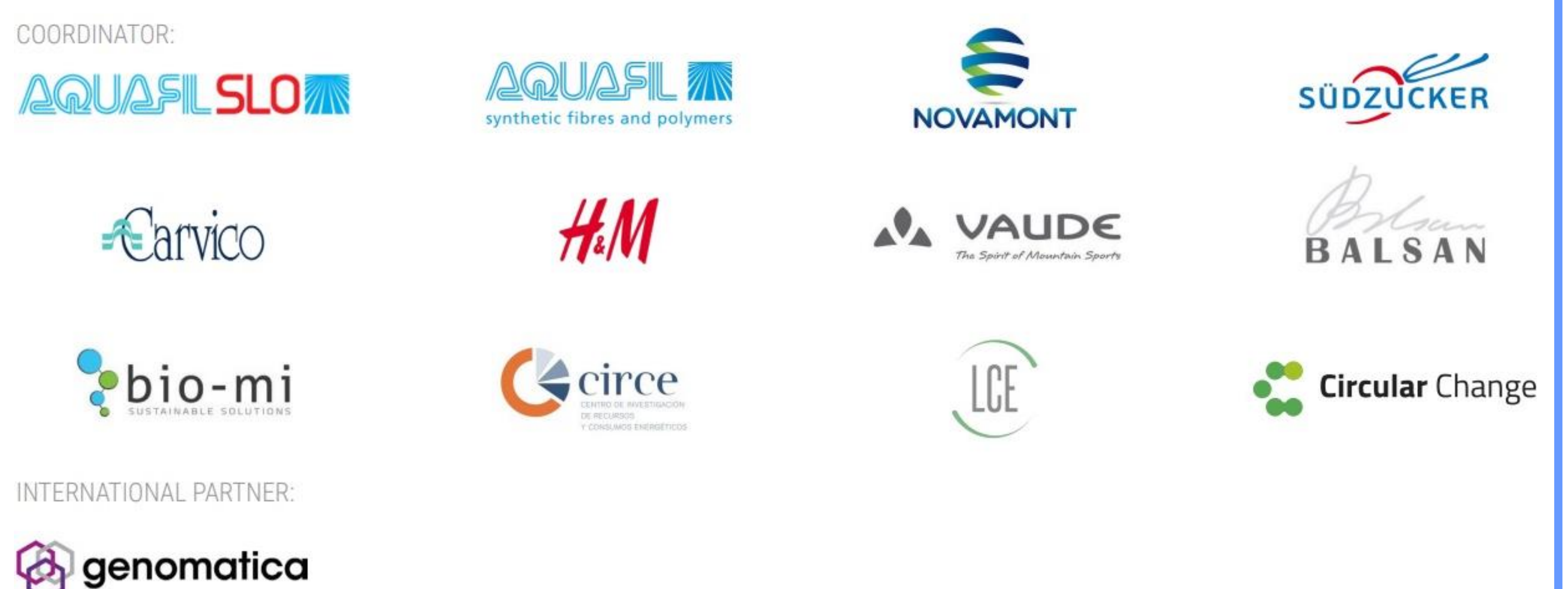
Figure 3. Project partners

Bio based products: Bio-based products or materials are usually defined as products and materials from biological and renewable sources, such as plants. Raw materials like minerals and fossil fuels, despite being extracted from earth, are not considered in this category given the long period their production takes (i.e. beyond a century). This means that a plastic made out oil from petroleum is not bio-based, whereas a plastic made from vegetable oils is indeed a bio-based product. Nylon, for example, is a plastic that can be produced from both sources.