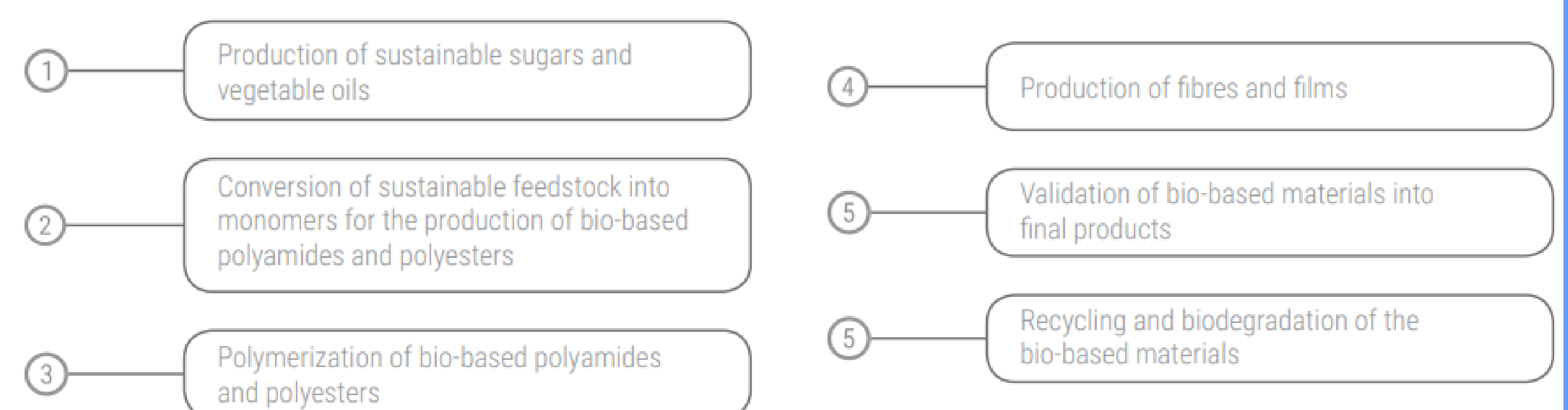
Figure 2. The innovative process introduced by the EFFECTIVE.

CONCLUSIONS: The EFFECTIVE project is using various sustainable and renewable feedstocks as a starting point to produce biobased building blocks of high commercial interest. In addition, two parallel value chains have been established to convert the obtained biobased building blocks into polymeric fibres, materials and compostable films for the subsequent application into large consumer products.