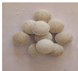
Figure 2. Tablets formulated from fenugreek seed silver nanoparticles.

The direct compression method was used to make the tablets. The formula for the solitary tablet per batch required to prepare 200 mg of a tablet is given in Table 1. The required quantity of disintegrant, binder, diluents, anti-adherent were passed through sieve no. 80 separately and then mixed with the assistance of mortar pestle then the resultant powder was compressed into tablets by using a single punch rotary compression machine [9]. The observations of tablets are mentioned in results and depicted in Figure 2.