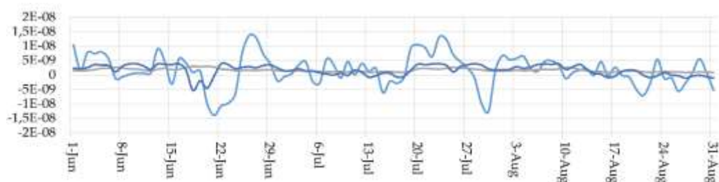
Figure 3. Approximation of the discrepancy of equation (5) (light blue line) using linear (grey line) and cubic (dark blue line) expressions from y_1(t) .

where \alpha_0, \alpha_1, \alpha_2, \alpha_3 are numerical coefficients, and \varepsilon(t) is noise term. The estimation of coefficients in (7) was carried out using regression analysis. Two hypotheses were tested: cubic and linear dependance of R(t) on y_1(t) . The cubic expression from y_1(t) better describes the behavior of the residual than the linear one (Figure 3). Analysis of the term \varepsilon(t) in the case of cubic approximation of the residual shows that it is a Gaussian noise.