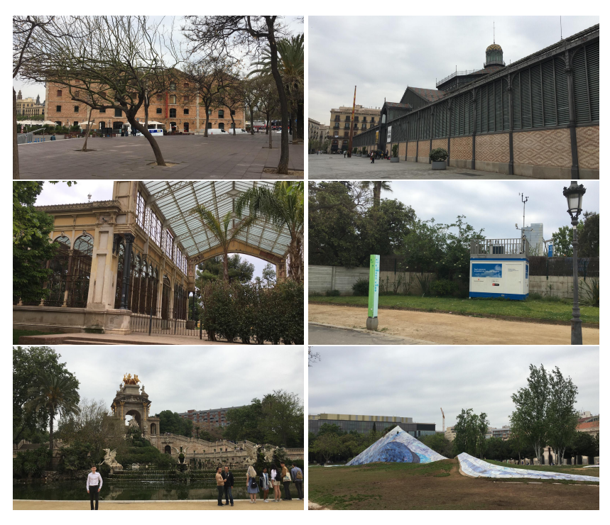
Figure 3. Images of all the points in the Conscious Walk: ( i ) Starting point, ( ii ) First Stop, ( iii ) Second Stop, ( iv ) Third Stop, ( v ) Fourth Stop, ( vi ) Final Stop.