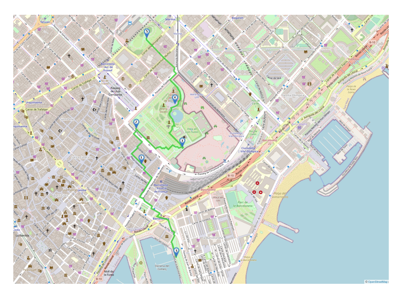
Figure 2. Conscious Walk Route Design.