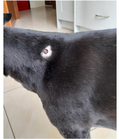
Possible snake bite wound in a dog.