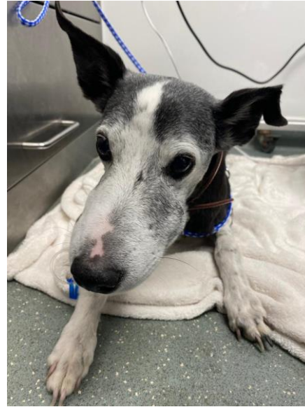
Oedema of the face and mouth in a female dog bitten by a venomous snack.

On physical exam it was panting, temperature 38.3°C, swelled around the mouth that went towards the ventral head, painful at the touch that not allowed head manipulation. Admitted and placed on IV fluids, with meloxicam, chlorpheniramine and buprenorphine, a fan was also placed to help to cool down. Swelling progressed to the axilla region and paracetamol was added to the treatment. The animal did not eat, she conyined treatment with IV fluids, Piriton; Dexadreson, Synulox, Prevomax and omeprazole. The animal fully recovered.