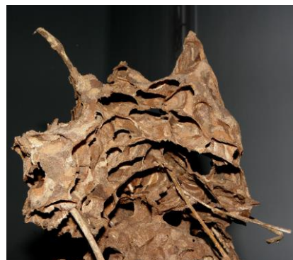
Figure 4. Cellular structure of roof cone.

2 large usually round entrance holes on the basal edges of the nest were observed. Some nests with 6-7 small holes were also seen on the surface of the walls. Although, the wasps were seen entering and leaving through all these holes only the 2 larger ones appeared to be actual entrance holes. One of the striking features of the nest is the hypertrophy of the envelope above the combs into a prominent roof cone. The roof cone has a cellular structure and is hard in texture as compared to the thin covering of the basal layers of the nest (Figure 4).