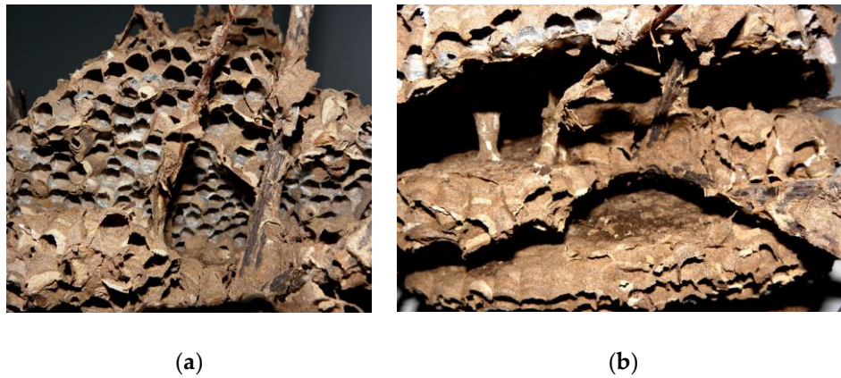
Figure 3. a and Figure 3b: View of connecting petioles in between the comb layers.

2 large usually round entrance holes on the basal edges of the nest were observed. Some nests with 6-7 small holes were also seen on the surface of the walls. Although, the wasps were seen entering and leaving through all these holes only the 2 larger ones appeared to be actual entrance holes. One of the striking features of the nest is the hypertrophy of the envelope above the combs into a prominent roof cone. The roof cone has a cellular structure and is hard in texture as compared to the thin covering of the basal layers of the nest (Figure 4).