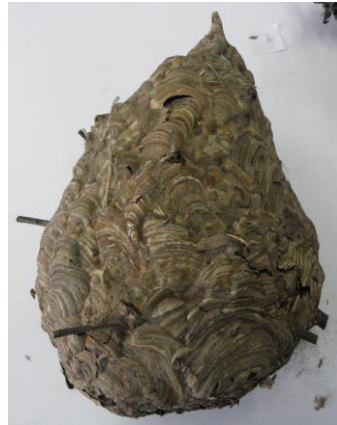
Figure 1. Entire nest of Vespa affinis .

The architecture of the nest is in the pattern of a spiral staircase with a central and several auxiliary petioles supporting each of the comb layers ( Figure 2 ).