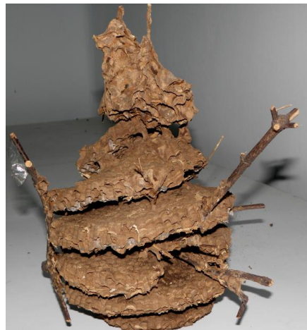
Figure 2. Spiral staircase pattern in nest architecture of V. affinis .

The architecture of the nest is in the pattern of a spiral staircase with a central and several auxiliary petioles supporting each of the comb layers ( Figure 2 ).