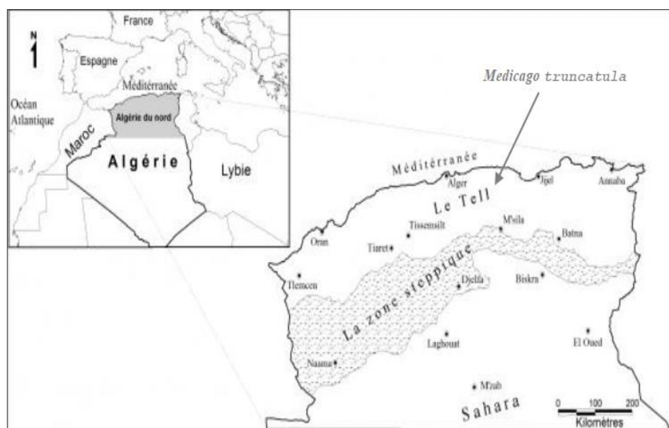
Figure 1. Location of Medicago truncatula Gaertner in Algeria

A two-factor analysis of variance test (ecotype and treatment) was performed on data obtained for pollen tube length. The relative data for each treatment, as well as those of the control, were analyzed independently by a one-way analysis of variance test (ecotype). All statistical tests were performed with Statistica software.