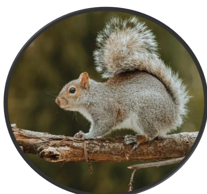
Grey squirrel ( Sciurus carolinensis )