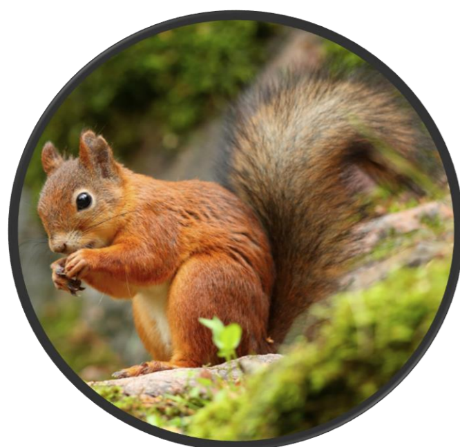
Red squirrel ( Sciurus vulgaris )

This work aims to present a view regarding the impacts of this disease in European red squirrel ( Sciurus vulgaris ).