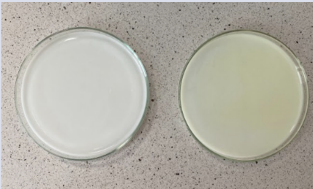
Fig. 1 Hydrogel dressings containing plant adaptogens

Hydrogel based on peptide nanocarriers containing adaptogens