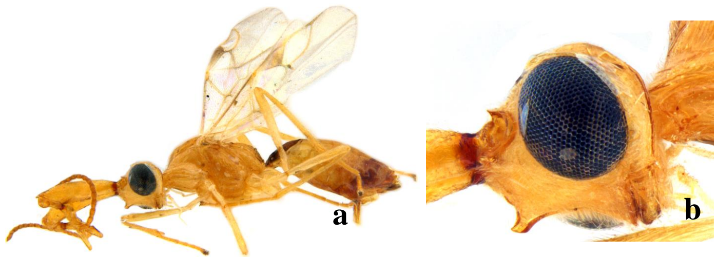
Fig. 2: Streblocera (Asiastreblocera) sp. female (a. Habitus, b. Lateral face view showing acute horn)