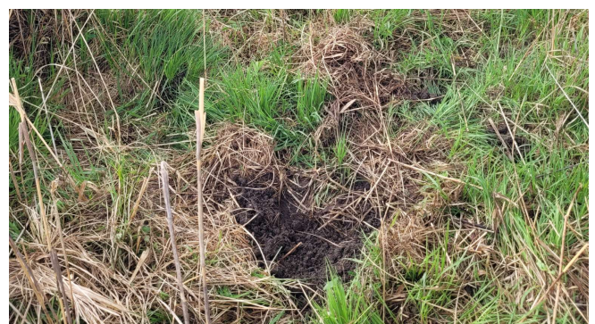
Fig. 2. The recultivated whole after counting the earthworm and collecting the soil samples in the lower and wetter part of the peaty meadow in the Galgahévíz area, Hungary (20 th of April, 2020).

Both sampling sites (the hilly area and the peaty meadow) proved the hypothesis: the lower section of the steep slopes and the less sandy area of the peaty meadow provided better habitats, and this was associated with higher earthworm abundance and earthworm weight. The research provides a baseline for further investigations because there is a lack of related publications.