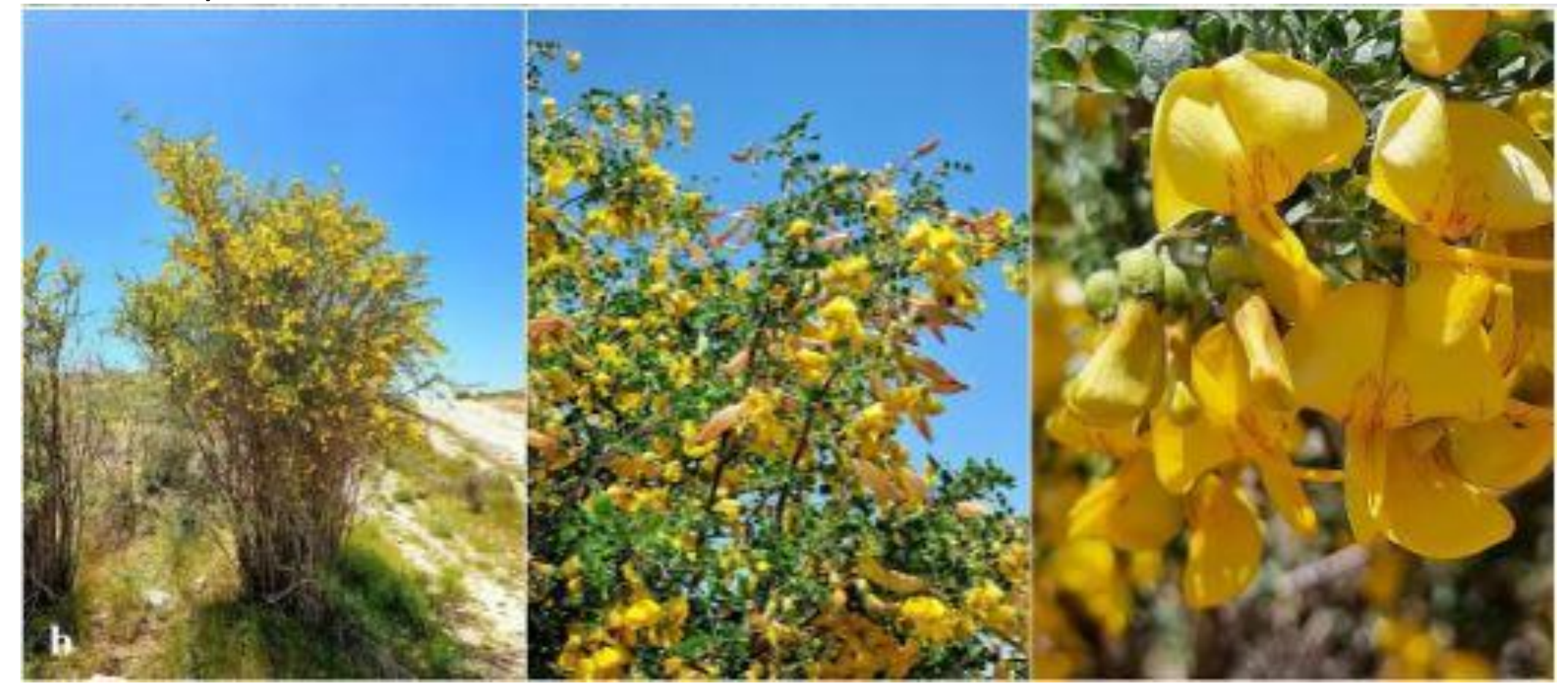
Fig. 1. Colutea persica in natural habitats

In this study, we developed a maximum entropy model (MaxEnt) to predict the present and future distributions of Colutea persica under two representative concentration pathways (RCP 4.5 and RCP 8.5) for the 2050s and 2070s.