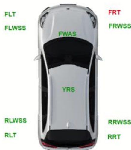
Figure 5. Displaying the Fault Result on the HMI screen.

In addition, this faulty value is shown on the HMI as in Figure 5. In this way, the user can easily track which sensor or actuator is faulty at that moment from the HMI.