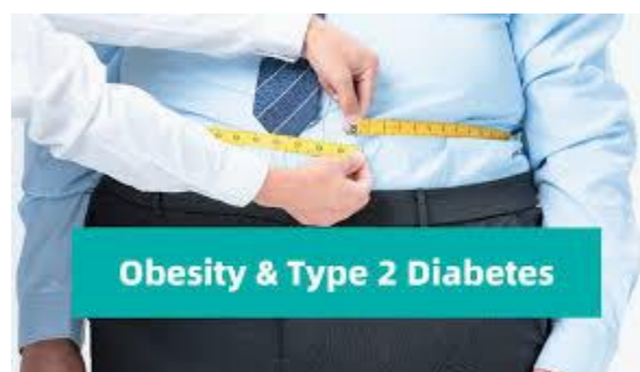
Obesity & Type 2 Diabetes