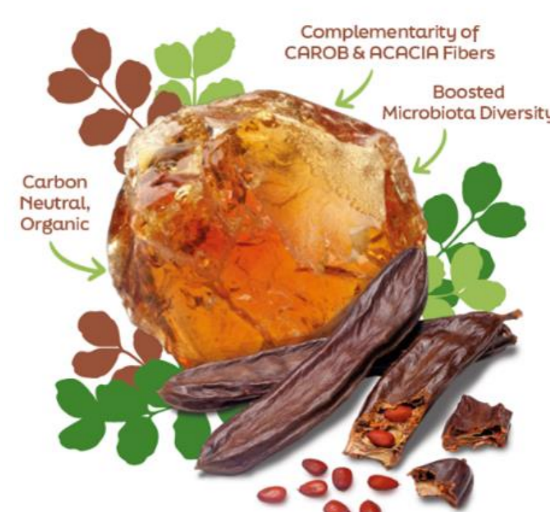
Complementarity of Carob & Acacia in delay and area