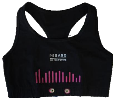
the Visible Sensor line

All the participants demonstrated a great interest in wearable sensors, considering them comfortable and useful for the monitoring of their lifestyle.