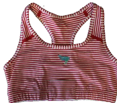
the Hidden Sensor line

Samples and prototypes of PEGASO Smart Garments.