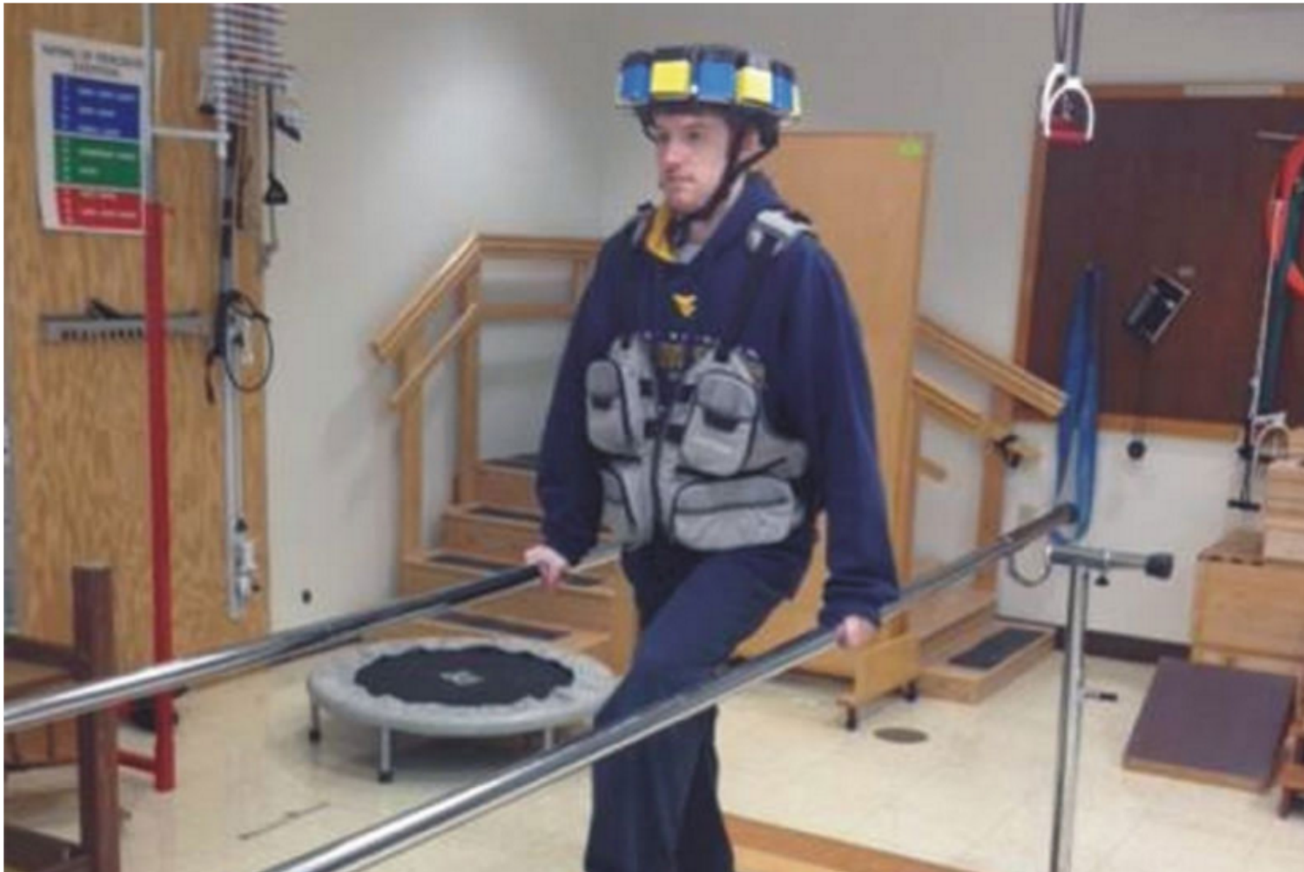
Wearing the [future] portable scanner