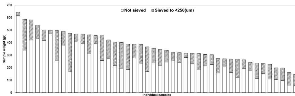
Figure 1. Weight of samples distribution from largest to smallest. Two portions can be seen: The first after homogenization, and the second after sieving to < 250 \mu\text{m} .