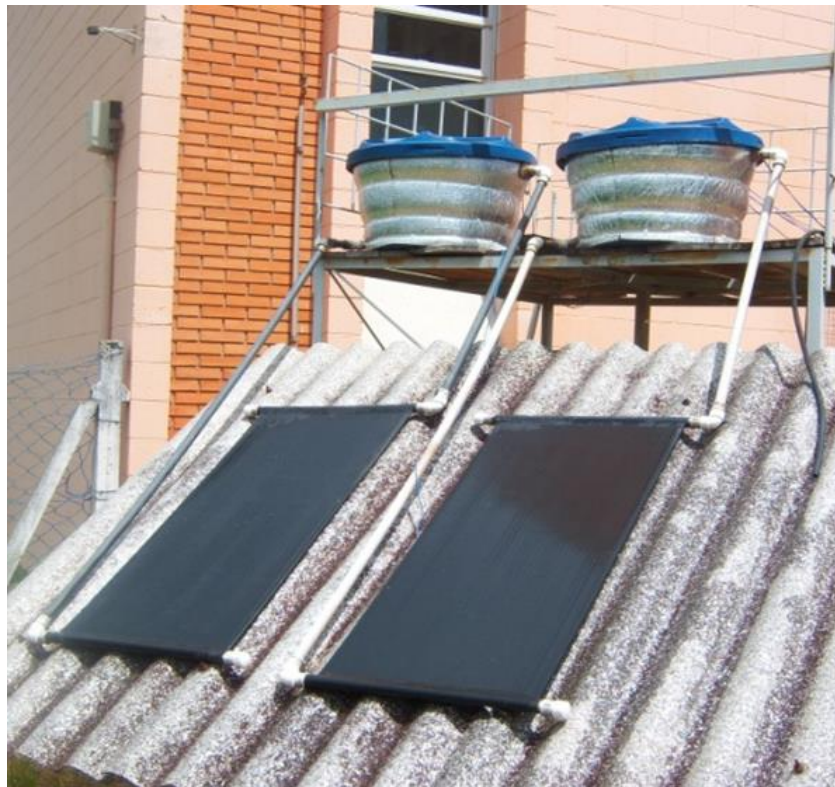
Figure 2. Two low-cost solar heating systems assembled (100 L each): PVC solar collector and hot water reservoir with thermal insulation (polymeric coating) outside the tank.

Figure 3, in its turn, shows the overnight temperatures (6 p.m. - 6 a.m.) assessed for the hot water inside the reservoir and for the external environment, as well as the water temperatures estimated by the simulation.