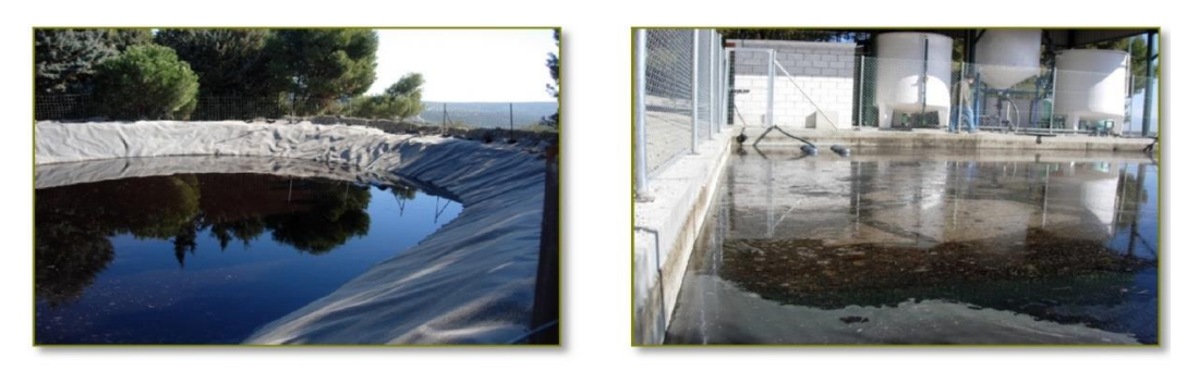
Figure 1. Olive mill wastewater.

In Mediterranean countries, more than 2.4 million tons of olives are produced every year, which corresponds to 95% of total world production. Due to the fact that 90% of this amount is destined for olive oil production, the proper treatment of OMW is crucial [2]. As a waste, OMW consists a dark liquid, with an intense odor, high turbidity, high organic content, and relatively low pH (Figure 1).