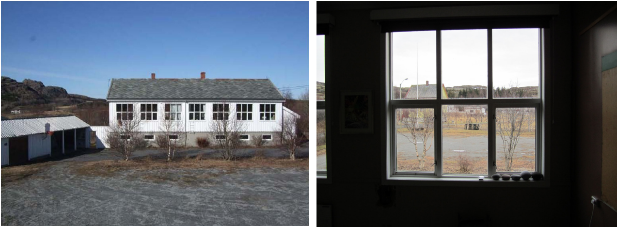
Figure 1. (a) Linesøya school building; (b) view through the window

Is it possible to lower resource use and at the same time increase the quality of the built environment? Is there necessarily a conflict between low-energy design and usability? Can architecture and planning actually contribute to lowering a local community's carbon footprint? And can this be achieved while maintaining a high quality of life and a stimulating built environment?