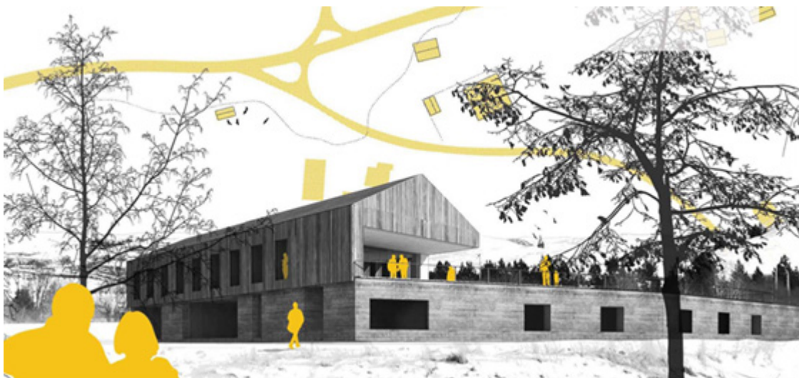
Figure 2. Linesøya project proposal after renovation

The students submitted four A1 posters containing project and site plans along with schematic diagrams showing the environmental and architectural strategies used in their design. Student calculation reports show that most of the designs for the renovated building barely reach passive house standard. However, the students do report an increased awareness and knowledge about the vast