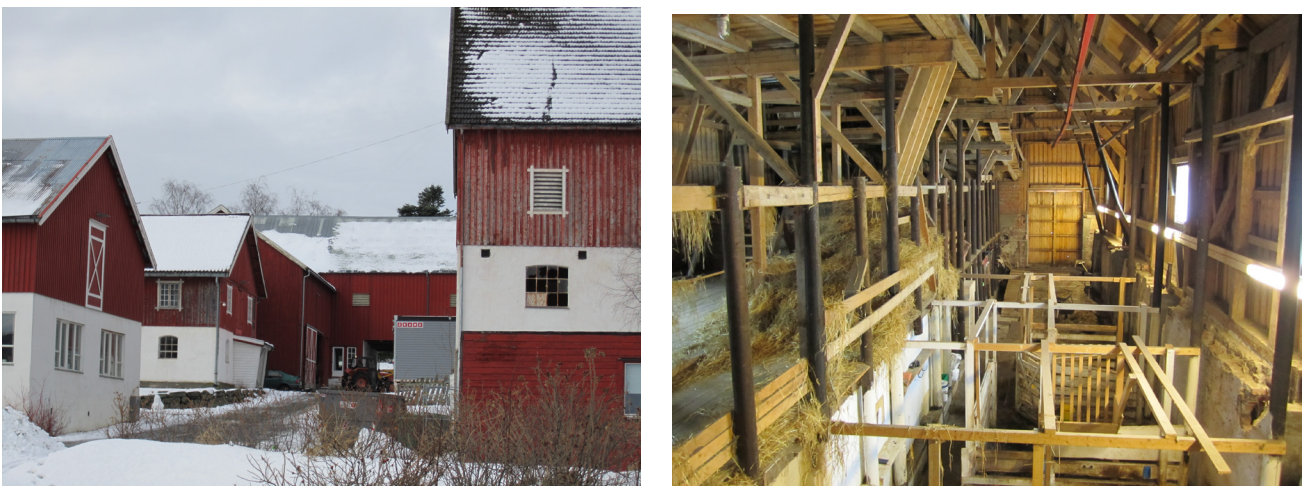
Figure 4. (a) Rotvoll farm; (b) Rotvoll barn

The students were again encouraged to work on integrated design solutions in which architecture and technology support and enhance each other. They needed to combine good indoor comfort with energy conservation, including energy supply and use of renewable energy. To this purpose, the students are taught a range of tools that can be used to document energy performance, such as ECOTECT and Simien.