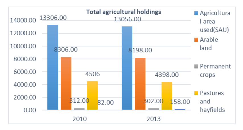
Figure 2. Agricultural holdings with the utilized agricultural area.

Note: Expenditure in commitments for direct payments and market measures; ceilings of support for rural development.