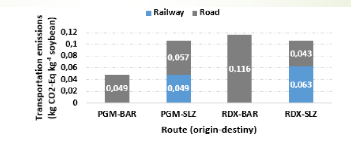
Figure 2. Climate change (GWP 20a) emissions from soybean transportation using IPCC 2013

<sup>1</sup> Transshipment in Porto Franco, state of Maranhão; <sup>2</sup> Transshipment in Palmeirante, state of Tocantins; <sup>3</sup> Barcarena, state of Parál <sup>4</sup> São Luis, state of Maranhão.