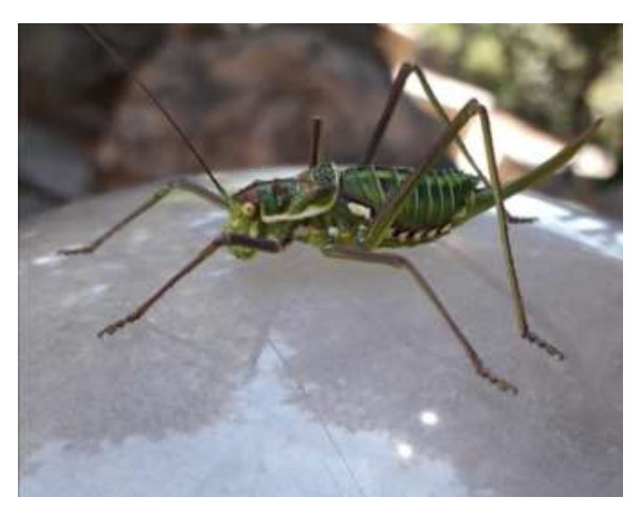
Figure 1. Uromenus annae, female from Usinavà (Picture FoReSTAS).

Sardegna, Supramonte di Orgosolo, Foresta Demaniale di Montes, Località Campu Costaria, 1000m, 40°09'32.5"N 9°26'28.7"E, 1 November 2020, 1 female field observation (M. Manca, FoReSTAS), Figure 3, star 3 in Map 1.