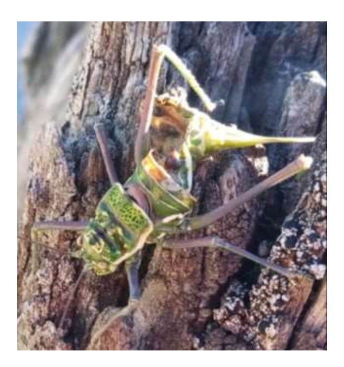
Figure 3. Uromenus annae, female from Foresta di Montes, Campu Costaria.