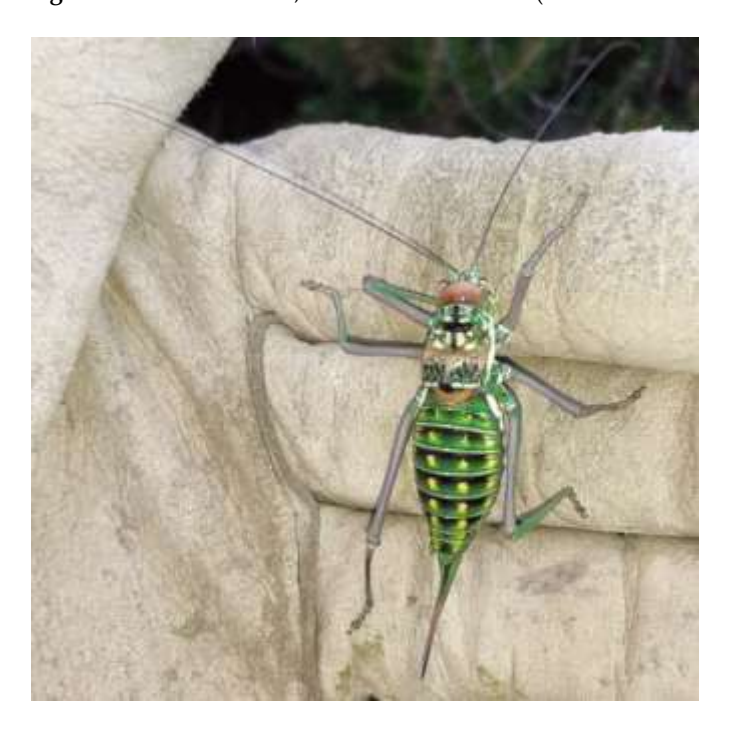
Figure 2. Uromenus annae, female from Foresta di Montes, Punta Mandra de Caia.