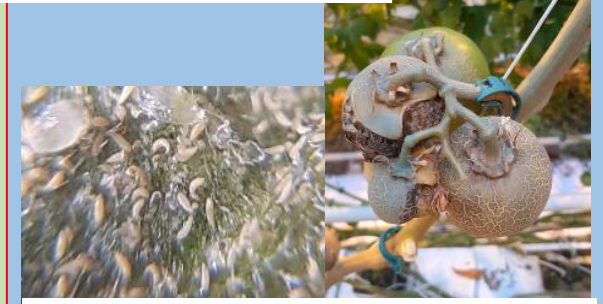
Aculops lycopersici tomato rust mite - adults under the microscope and fruit damage

Tuta absoluta tomato leaf miner moth - feeding ground under the stalk in the unripe fruit and leaves with visible mines caused by the larvae