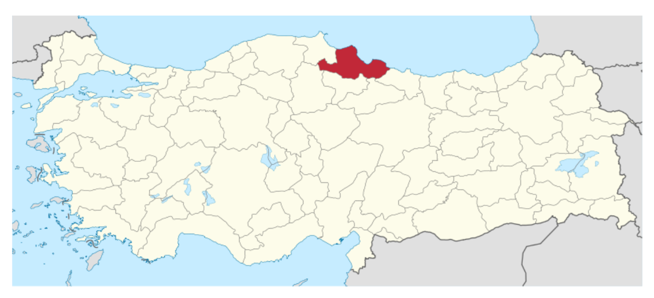
Figure 1 Samsun and its location in Turkey

Samsun, located in central part of the Black Sea Region of Turkey is the most crowded and developing city of the Region (Figure 1). Its population is 1.356.000 by the end of 2020 (TUIK, 2021) and it is the 16th crowded city of Turkey. It is surrounded by the Black Sea in north and by Ordu city east, Tokat and Amasya in south and Sinop and Çorum cities in west. The city has an area of about 9,725 km<sup>2</sup>, and 45% of this area is mountains, 37% plateaus and 18% plains.