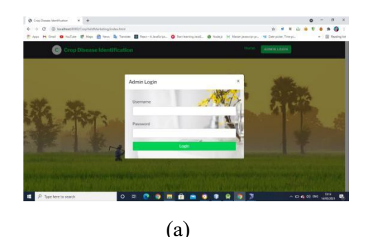
Admin login page