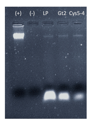
Figure 2. DNA/RNA molecules detected on gel electrophoresis as effect peptide extract treatment. Legend: (+): genomic DNA extracted from Staphylococcus ; (-) control negative ( Staphylococcus no peptide treated), no DNA/ RNA detected; LP, Gt2, Cys5-4: DNA/RNA molecules detected upon 1 X MIC of LP, Cys5-4 and Gt2 peptide extract treatment.