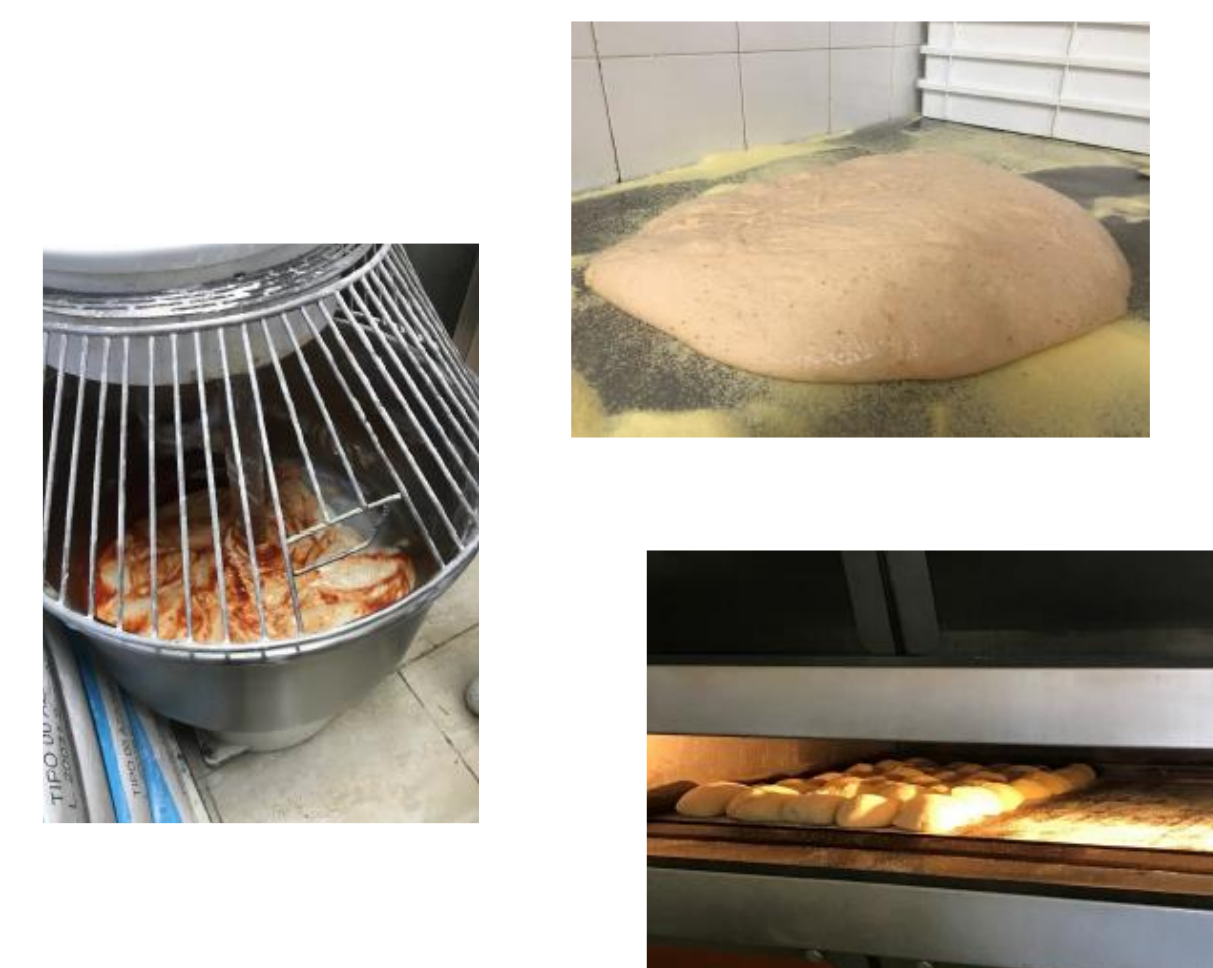
Preparation of the dough and baking of bread

Cut slice and Texture Profile Analysis (TPA) rheological analyses were performed with a TA-XT Plus Texture Analyzer (Stable Micro Systems Ltd, UK) [3]. Exponent software 6.1.4.0 (Stable Micro Systems Ltd, UK) was used for data acquisition and integration. The Cut Slice test was performed using a Blade Set with Knife probe (HDP/BSK set probe, Stable Micro Systems Ltd, UK) with the following parameters: pre-test speed: 1 mm/sec; test speed: 2 mm/sec; post-test speed: 10 mm/sec; distance: 100 mm; trigger force: 3 g; data acquisition rate: 400 pps. The TPA (Instrumental Texture Profile Analysis) test was performed using a 100 mm compression platen (P/100 compression platen probe, Stable Micro Systems Ltd, UK) probe on a whole bread sample with the following parameters: pre-test speed: 1.00 mm/sec; test speed: 5.00 mm/sec; post-test speed: 5.00 mm/sec; distance: 20.0 mm; trigger force: 5.0 g; data acquisition rate: 400 pps. For each sample, three repetitions were carried out. From test results, the hardness, springiness, cohesiveness, gumminess, chewiness and resilience parameters were taken into consideration. Data were expressed as mean values; means were further analysed by one-way ANOVA and Tukey's test, at 5% probability, using statistical software (IBM SPSS Statistics for Windows, Version 20, IBM Corp., Armonk, NY, USA).