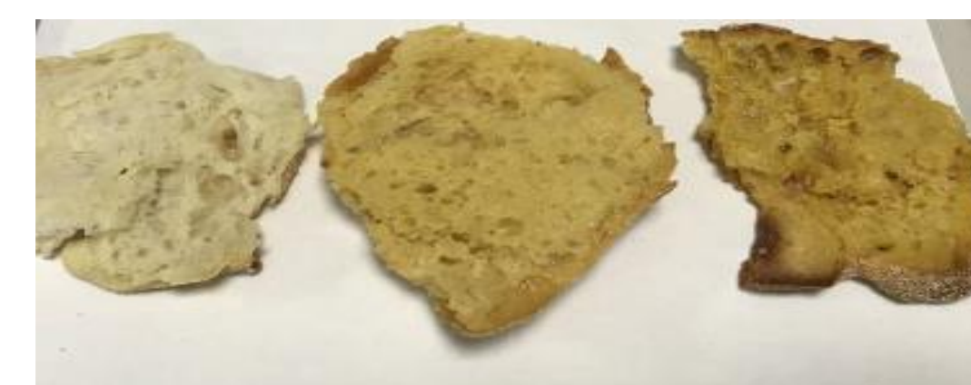
Goji bread samples

Samples were evaluated by descriptive sensory analysis by a trained panel of 8 adult judges (5 males and 3 females, aged between 23 and 65 years, recruited among departmental faculty staff). Samples were served in a standard sensory booth in random order at room temperature, with data averaged over three replicates. Assessors were trained according to ISO 8586:2012 guidelines for selection, training and monitoring of expert sensory assessors. Additional training was given with reference products to address specific taste and appearance descriptors. Panelists cleansed with mineral water between samples. Judges rated samples on a 10-point structured scale from 0 to 9 for appearance, smell, taste and texture descriptors, with a score 0 indicating the absence of the attribute and 9 an extremely high attribute value.