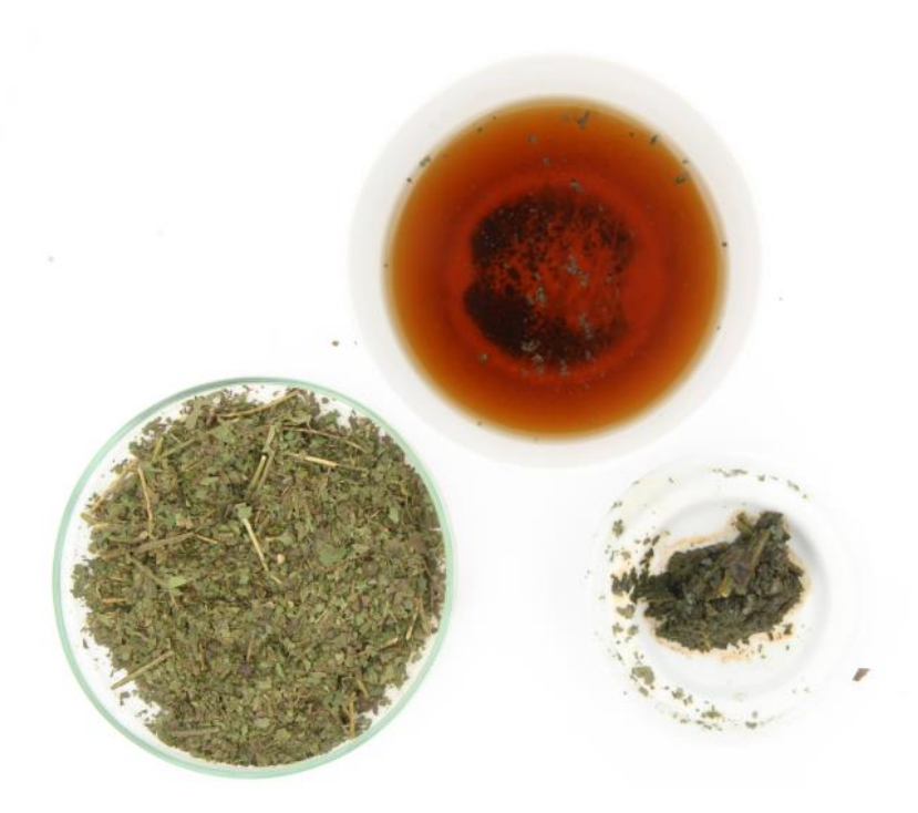
Figure 1. Example of coffee leaf tea (dried leaves, lower left; brewed beverage, top; spent leaves, lower right).

In order to assure the homogeneity of the samples, each one of them was granulated to a size at which they could pass a sieve with a pore size of 500 \mu m . The following methods were applied: