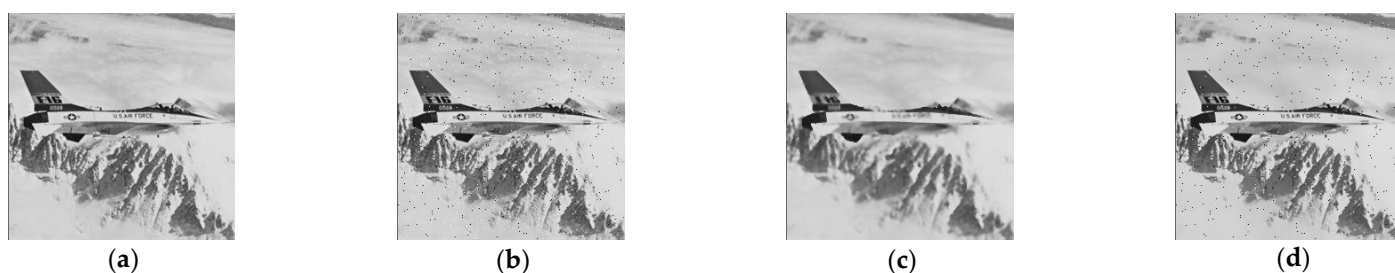
Figure 2. Filtering results for sample image " Airplane "; (a) Input image; (b) Image with noise added to (a); (c)Filtering result of (b) by L2GFI; (d) Filtering result of (b) by NLMF.

Figure 2-4 shows the original image, noise-added image, and result of applying each filter to the noise-added image for each sample image. The output images of each filter in Fig. 2-4 are compared by visual inspection. The output image of the NLMF showed no major changes in any of the samples compared to the noise added image. It can be confirmed that the NLMF has a high edge preserving performance, while low denoising performance for strong noise. The output image by the L2GFI showed that noise was removed in all the samples. Therefore, it can be seen that the L2GFI has higher denoising and edge preservation performances compared to the NLMF.