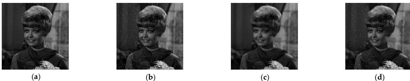
Figure 4. Filtering results for sample image " Pepper "; (a) Input image; (b) Image with noise added to (a); (c)Filtering result of (b) by L2GFI; (d) Filtering result of (b) by NLMF.