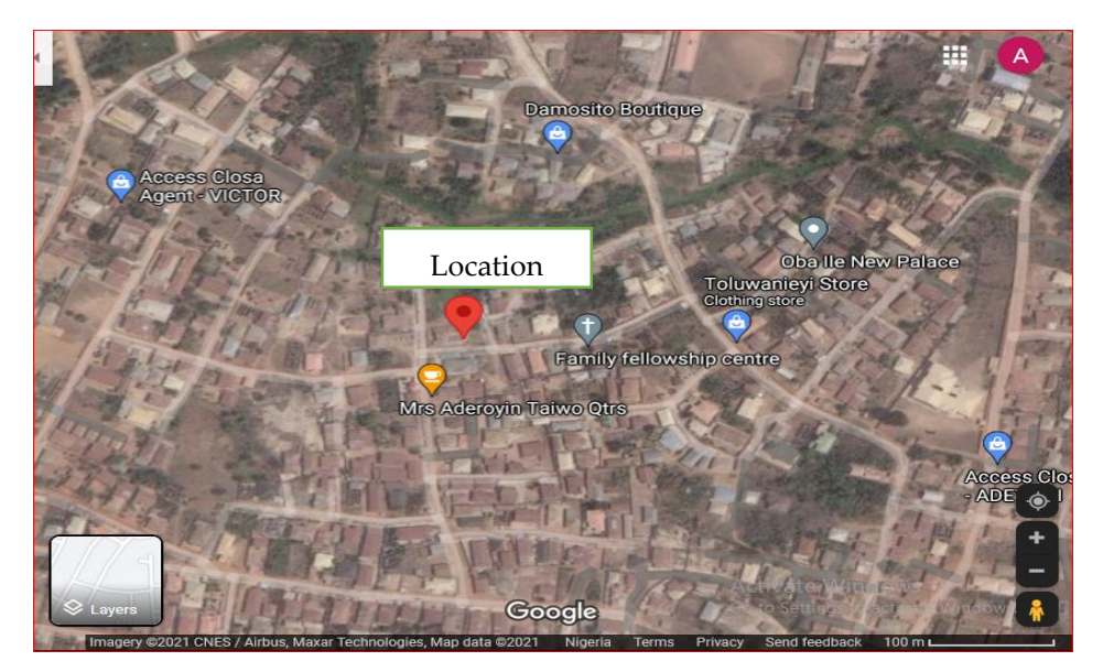
Fig. 1. The Goggle Map of the Study Location

The monitoring site, Oba Ile, is located in Akure, Ondo State, Nigeria (Latitude/Longitude: 7 16 04.4 N 5 14 29.1 E). The building is located in a residential area surrounded by unpaved roads (Figure 1). There were no known major point sources of emissions nearby.