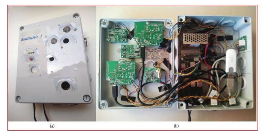
Fig. 2. The figure shows (a) the complete set-up of the low-cost sensor, and (b) the inlet of the sensor showing the power charger and other parts

(1, 2.5, 10), NO2, SO2, CO2, O3, temperature, and relative humidity. The sensor box was placed on a rack about 4 meters above ground. The building was separated from the road only by a fence, putting the sensor package about 6 meters away from the nearest lane of traffic.