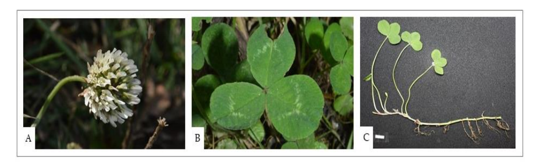
Figure 2. Trifolium repens in Itatiaia National Park. ( A ) inflorescence; ( B ) leaf composed of three leaflets and ( C ) Stolon.