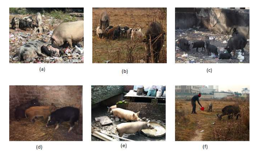
Figure 2. (a) Pig herd in Ramnagar (Nainital district of Uttarakhand) (b) Pig herd of mixed parental origin observed in Chandrabani (Dehradun district of Uttarakhand) (c) Pig herd in Jwalapur (Haridwar district of Uttarakhand) (d) Possible hybridised feral origin or boar piglet for sale or mating purpose (e) Semi-intensive system of pig management with housing facility (all the pen is made of brick with tin as a roof within the house premises) (f) Extensive system of pig management with no housing facility.

Households kept 2–4 adult sows and 1–3 hybrid boars with their piglets in their herd (Figure 2a–c). They identified the breeds as indigenous and mixed parentage of indigenous crossed with the exotic breed and putative crossed with a wild pig. 28.6% pig rearers maintained probable breeding boar of feral origin in secrecy due to its easy availability and high sale value (Figure 2d). The combination of farrow to finish and piglet production systems are observed in 85.7% of the households surveyed. Only 14.3% of the households practiced fattener production. The major rearing pattern observed in the study area was semi-intensive system (96.94%) (Figure 2e) followed by extensive (3.57%) (Figure 2f) system. Though these system needs less capital investment but disease incidences and parasite infestations are high.