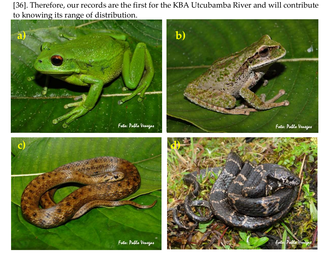
Figure 2. This figure shows the species reported for the first time for the KBA–Rio Utcubamba (PER-84): G. aguaruna ( a ); G. spectabilis ( b ); T. affinis ( c ) and D. palmeri ( d ).