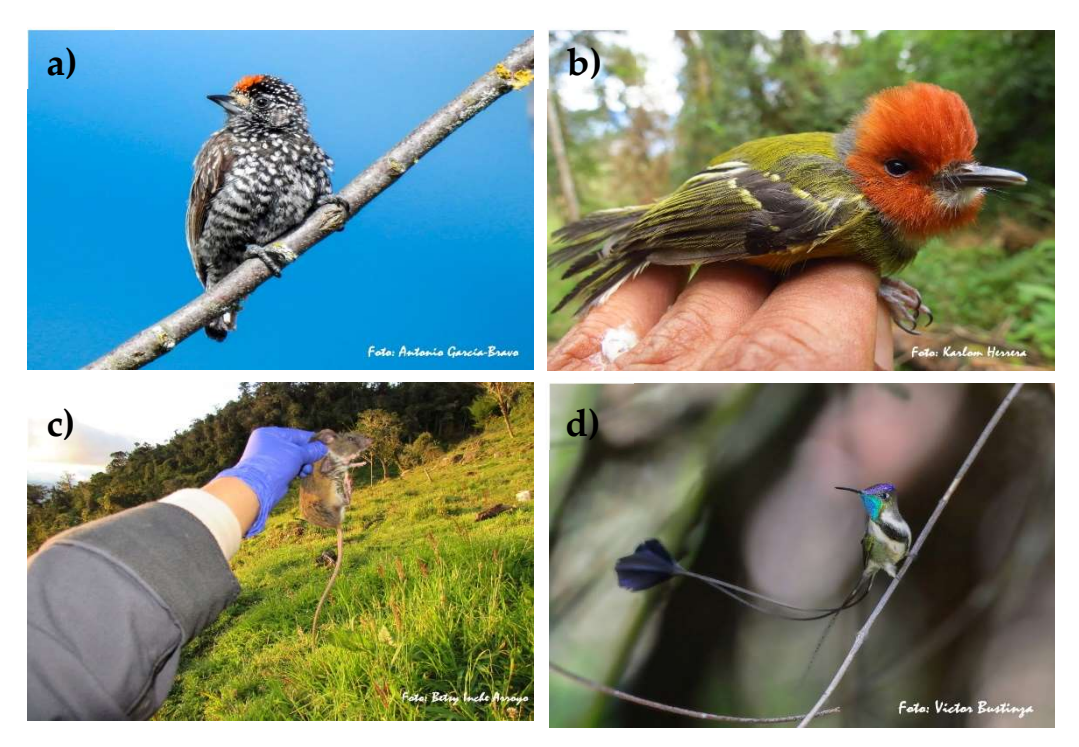
Figure 3. This figure shows endemic fauna species recorded in the KBA- Rio Utcubamba (PER-84): P. steindachneri ( a ); P. luluae ( b ), T. ischyrus ( c ) and L. mirabilis ( d ).

Our area of study lacks detailed research, those that have been previously carried out over time, with the purpose of implementing projects, whose objective is the creation of Regional Conservation Areas (RCA), within which is the project for the creation of the RCA "Gocta, Yumbilla and Chinata Falls" in the provinces of Bongará and Chachapoyas [8], study that reported the existence of species of mammals (52), reptiles (15), amphibians (18). In addition, the existence of 223 species of birds was reported [43], including endemic amphibian species (C. lemniscatum, G. aguaruna y G. spectabilis), reptiles (T. affinis), birds (G. przewalskii, S. macropus y S. femoralis) and mammals (T. ischyrus). With these records, the number of endemism for the KBA-Rio Utcubamba is increased, which makes it an area with a higher number of bird endemics than the western side of Paso Porculla and the Huancabamba-Chamaya sub-basin, where up to four endemic bird species have been reported [44]. It moreover shares a similar number of endemics with the Inter-Andean Seasonally Dry Tropical Forests of the Marañón valley, where four species of amphibians, 28 reptiles, 13 birds and 5 mammals endemic to Peru have been reported [45]. From this, our research contributes to rediscover the species of wildlife in the KBA- Rio Utcubamba (PER-84), being an input for the implementation of species conservation policies and the creation of areas for the protection of these.