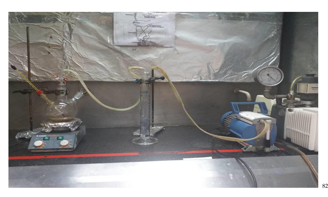
Figure 1. New sulfuric acid recycling system with bleaching soil