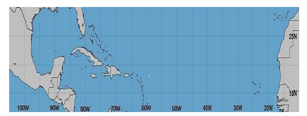
Figure 1. Study area.

Information from the United States National Hurricane Center was consulted, using the Tropical Weather Discussions and the Tropical Weather Outlook. Also taken into account were the General Weather States, the rainfall data from the meteorological station network of the Cuban Institute of Meteorology, the pluviometric network of the National Institute of Hydraulic Resources and the Hurricane Season Summaries (available at the InSMET website https://www.insmet.cu/CiclonesTropicales/Resumendetemporada/). Surface maps, low levels (850 hPa and 700 hPa), medium (500 hPa) and high (200 hPa), and satellite images were analyzed.