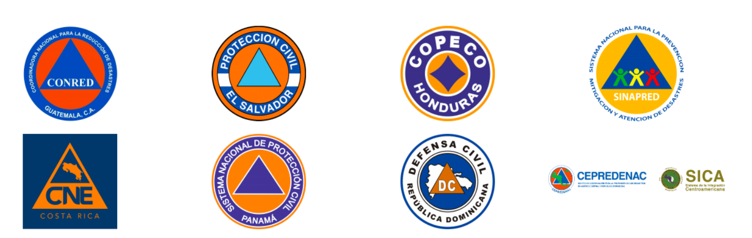
Figure 1 . Governing Bodies Members of the Coordination Center for Disaster Prevention in Central America [5]. The entities act individually in their countries of origin, but during emergencies they weave regional support networks, involving the availability of human resources and physical assets to counter socio-environmental challenges.

intertwined with economic management, social cohesion management and environmental management through a systemic approach [4 (p.6)].