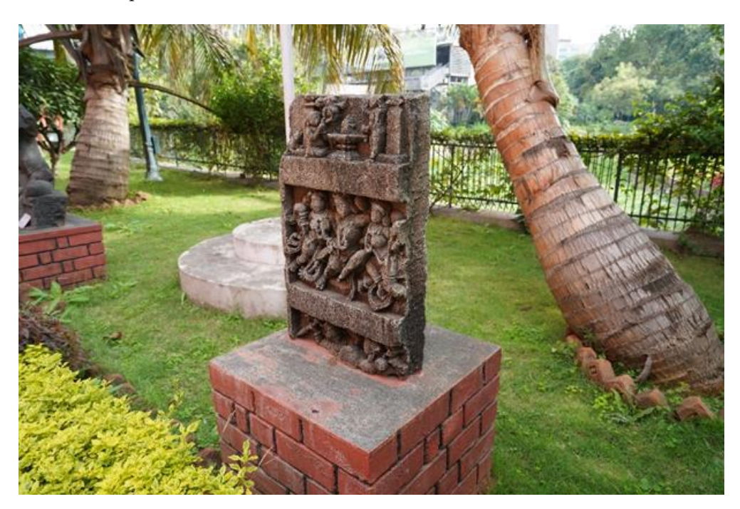
Figure 1. Depicts the perspective view of Hero-Stone.

Hero-Stone (Figure 1.) documented in this study was originally found in an archaeological site of Halebidu, Karnataka, which was later shifted to the Bangalore Government Museum, Bengaluru. This Hero-Stone dates to the time of Hoysala King Vishnuvardhana in the 12th century AD [18]. This is situated in an open area on the grounds of the museum where it is preserved carefully. A mirrorless digital camera was chosen to scan the Herostone and acquire the datasets.