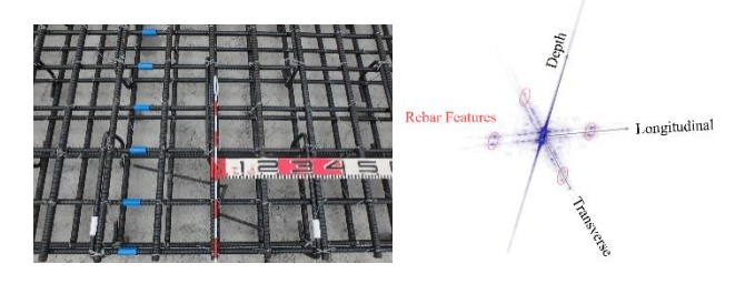
Figure 1 Location of rebars. Concrete is constructed afterwards (left). 3D DFT of the radar data (right).

radar data. As rebars being placed in a certain spacing, peaks appear on longitudinal and transverse axes in the frequency domain. Focusing on a surface that includes rebar vertex in the filtered data and by a peak detection method, 3D rebar mesh was produced.