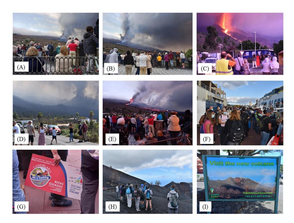
Figure 5. Visitors and tourists during (A–G) and after (H, I) the Tajogaite eruption.

This study highlighted the rich and varied heritage associated with the eruptive event at Tajogaite and the current tourist demand that exists to visit the volcano along with its territorial impacts. The identification, selection, and characterization of SGIs are more than justified as they respond to the demand for volcano tourism. It is necessary to propose the creation of virtual or real geo-itineraries, taking advantage of the selected SGIs, to show the exceptional volcanic heritage created through this eruption. This development undoubtedly enriches the geotourism sector, not only in the area affected by the eruption but throughout the island of La Palma.