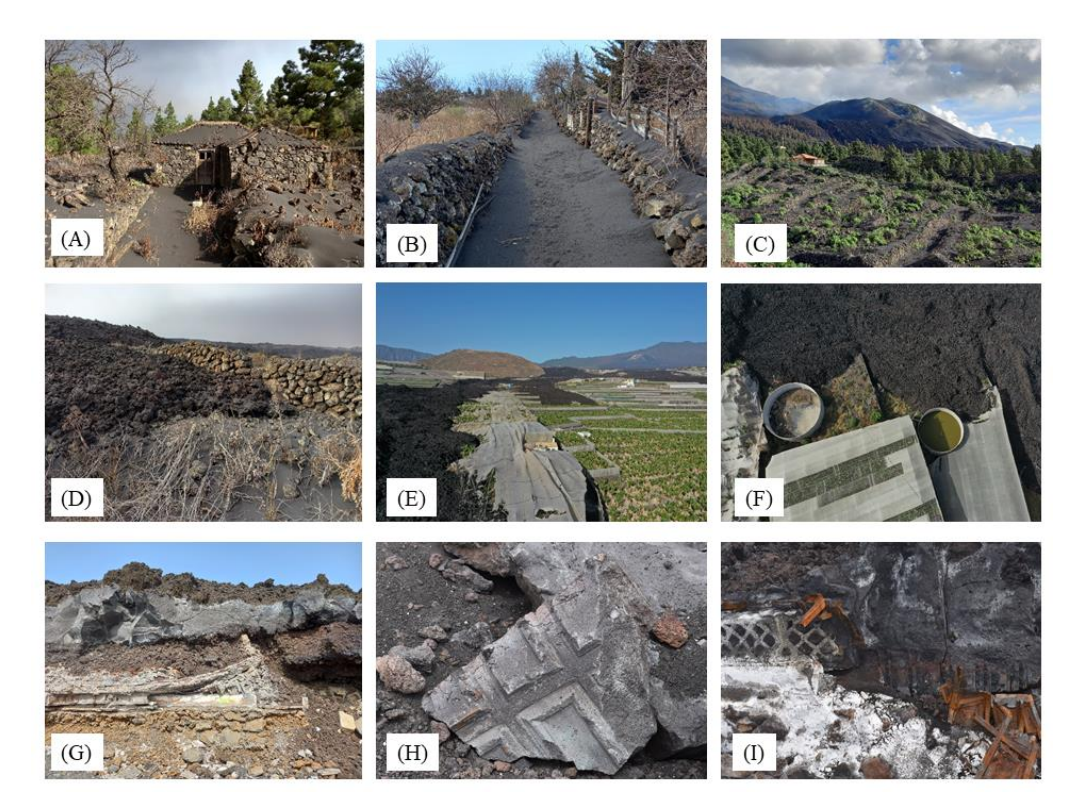
Figure 4. Cultural heritage of Tajogaite eruption. Traditional houses ( A ), pathways ( B ), stone walls ( D ), banana greenhouse crops ( E ), artificial ponds for crops ( F ), house under lava flows ( G ), doors molds ( H ) and gardens under lava flows ( I ).

Figure 3. Geoheritage of Tajogaite eruption. Eruptive column one day after the onset of eruption (20 September 2021) ( A ), different craters ( B ), hornitos and lava tube ( C ), north lava delta ( D ), lava lake and lava channels ( E ), eruptive fissure with hornitos and pahoehoe lava flows ( F ), aerial photo of pahoehoe lava fields and lava tubes ( G ), active aa lava flow (23 de November 2021) ( H ) cinder cone and lava channels ( I ).