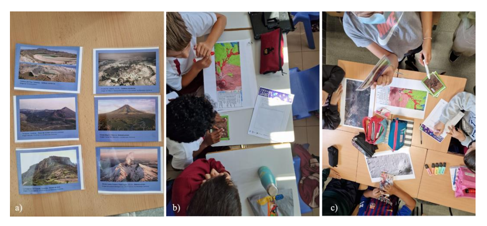
Figure 3. Workshop evidence: (a) Cards of volcanic buildings of volcanoes of the world (own production). (b and c) Primary school students working with the cards, maps and field notebook.

The identification of volcanic buildings by comparing them with images of volcanoes around the world was only offered to those groups of pupils who showed the greatest interest. These pupils needed help with the first examples and then quickly acquired the ability to recognize the structures. We believe that a longer activity would allow them to go more deeply into this part of the activity.