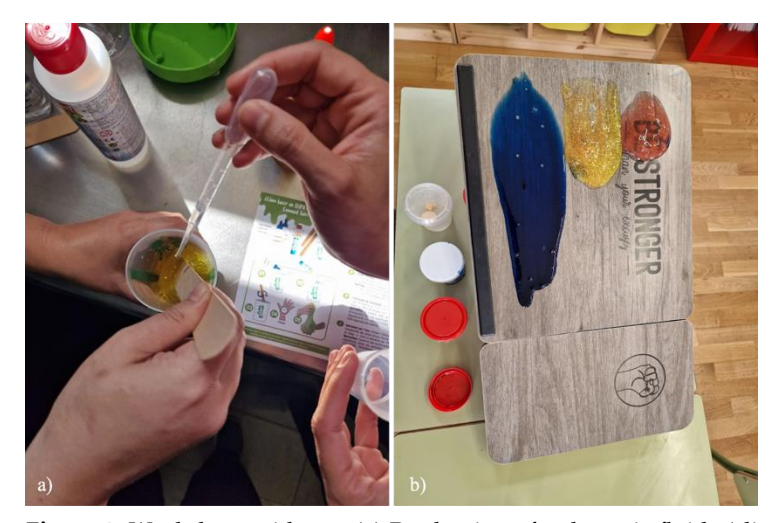
Figure 2. Workshop evidence: (a) Production of polymeric fluids (slime) with different viscosities, (b) Slime race experience in the classroom.

To connect these prior ideas with scientific concepts and vocabulary, the students are introduced to the relationship between a more or less explosive eruption and the morphology, types of materials deposited, color, etc. We use slime (viscous polymeric fluid) to simulate volcanic lava. If the lava is more liquid (less viscous), the eruption produces a larger volume of material that generally moves faster than more viscous lava. To see this property visually, we place three samples of fluid of different viscosity on a sloping surface at the same height in a race, to see which one moves faster, analogous to what would happen with lava flows (see Figure 2 (b)). Students hypothesize about which one will arrive first and then observe how they behave in the experiment and draw conclusions about the degree of destructiveness of each type of lava, dependent on the speed at which they reach the base of the valley.